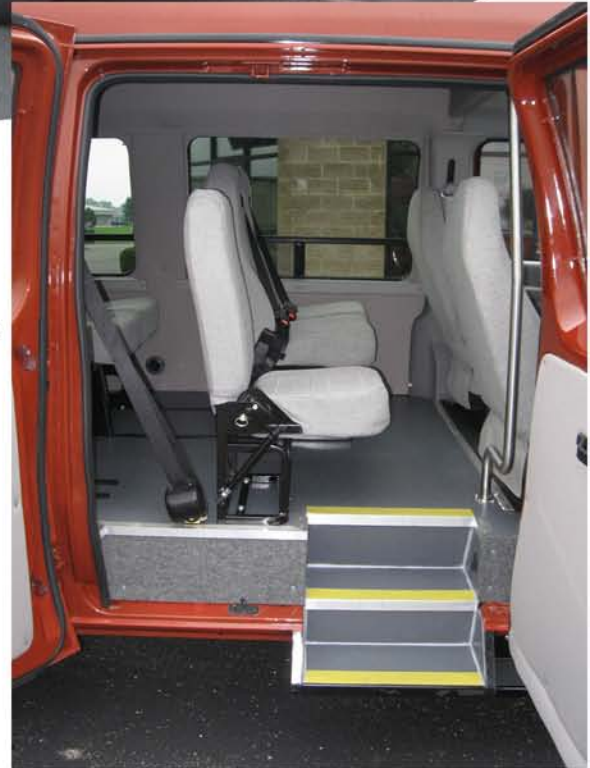
Heavy Duty Steel Z-Step Curb Side Entry With Running Boards